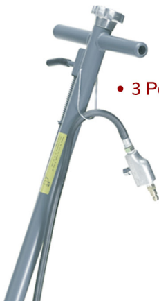
• 3 Position Locking T-handle