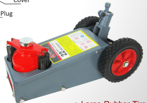
• Large Rubber Tires